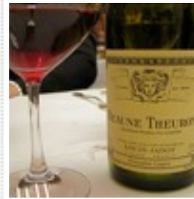
IW&FS Event wine

Food and wine are the essence of life. Therefore, we should only have the best.