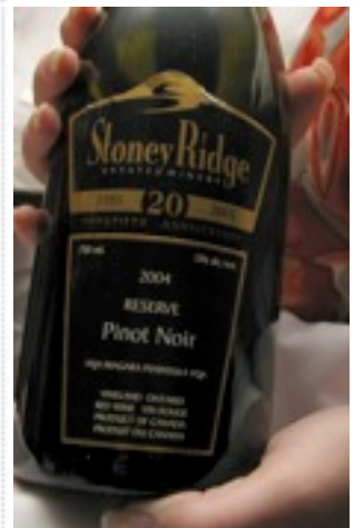
A Great Canadian Wine

There are many good restaurants within easy walking distance from your hotel as well as restaurants in two of the museums. Across from the Hotel is the entrance to Philosophers Walk , which leads directly into the University of Toronto, a pleasant area for walking.