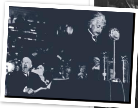
In October 1933, Einstein delivered the principal address in a London Meeting to aid refugees. Behind him is physicist Ernest Rutherford.