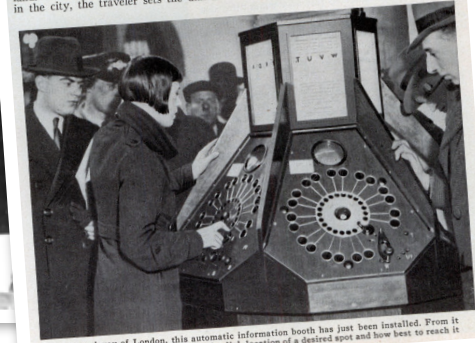
In the subway of London, this automatic information booth has just been installed. From it the travelers can learn, by working the dial, location of a desired spot and how best to reach it.

TWIRLING a dial helps subway riders find their way, at a self-service information booth just opened in London, England. To inquire how to reach any point in the city, the traveler sets the dial according to a printed list of instructions. The device then informs him of the place's location, the exact fare required, and the number of the platform from which the appropriate train leaves.